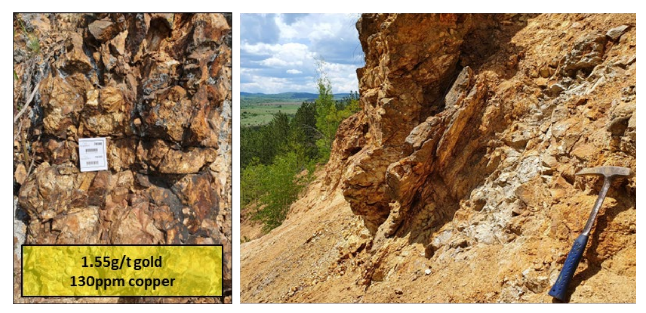
Plate 1. Outcropping QSP-altered andesitic volcanic rock sampled by Velocity, grading 1.55 g/t gold and 130ppm copper (left), and altered andesite fragmental & andesite porphyry with disseminated chalcopyrite (right).